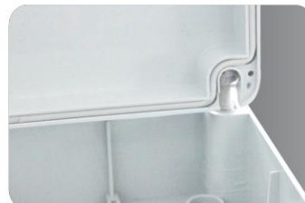
TB-AG-1419 - TB-AG-3038 塑料螺絲