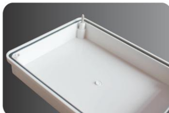
TB-AG-0812 ~ TB-AG-1115 金屬螺絲